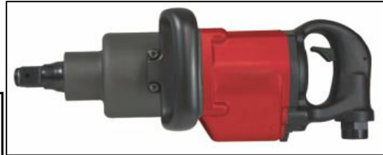
HIM-0223-EX 1" Dr. Air Impact Wrench w/8" Extension Anvil