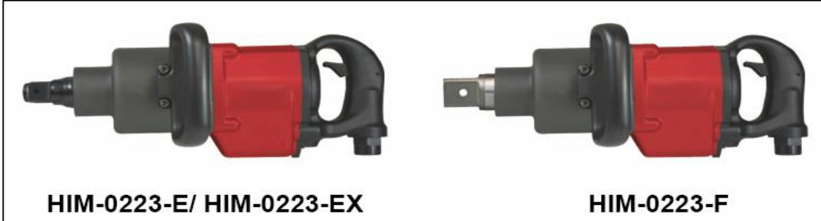
HIM-0223-E 1" Dr. Air Impact Wrench