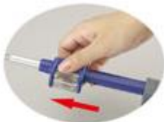
Pull the grip backward