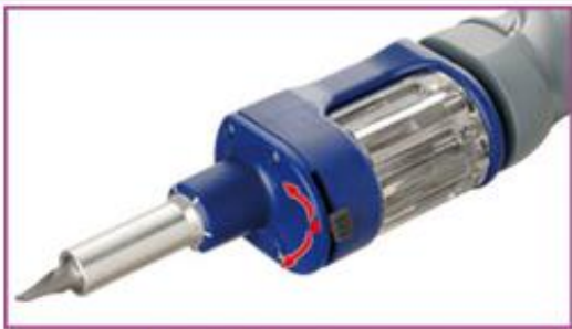
3 Setting ratchet function

*Patent in Taiwan / Germany / U.S.A. / China.