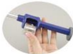
Load in a bit holder