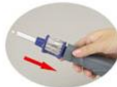
Pull back the grip to change bit