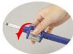
Rotate bit holder to choose a bit