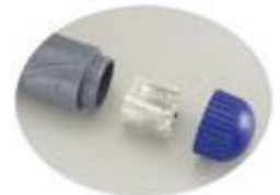
Another bit holder inside handle